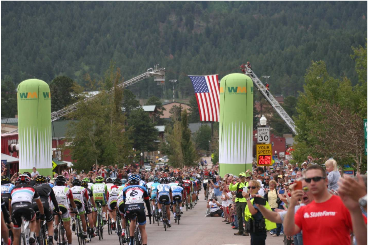
Pro Cycling Challenge Sprint, August 24, 2012, Woodland Park, Colorado